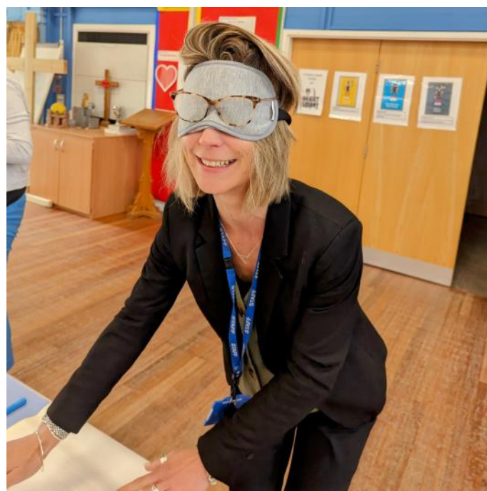
The Headteacher at St. Mark's Junior School joining in the fun.

three friends along the following week! Some young people have a strong faith, whilst others are starting a journey of exploring faith. Recently, we have enjoyed discussing what it means to be generous with our money, gifts and our time as well as playing games, eating snacks and providing space for the students to share and pray together.