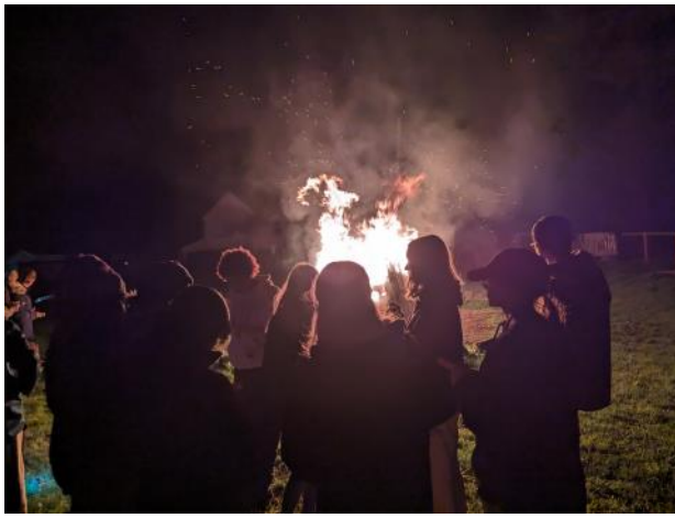
The bonfire at the residential.

relationships. As we explored the theme together, they were quick to encourage one another and felt comfortable worshipping together.