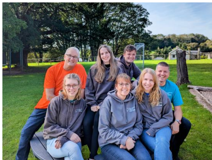
The Living Beyond Team

It was a special residential for lots of reasons. We had young people from a variety of Cheltenham and Gloucester churches, many of whom come to Underground. Two young people from Taunton joined us along with team members from Taunton Youth for Christ, and two more young people came from London. Even though many of the young people didn't know each other, there was a great atmosphere. The young people quickly built strong and supportive