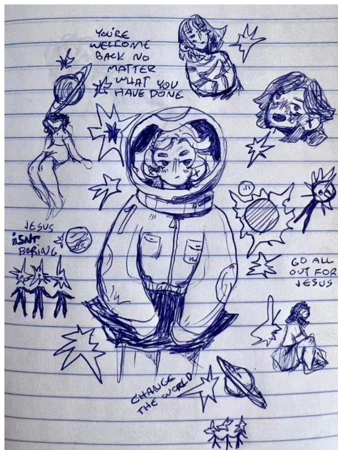
The visual notes one young person made in one of the talks.

Another young person drew pictures during the talks as a way of taking notes. She is an amazing artist and her pictorial notes were a great way for her to process what was being said. Other young people