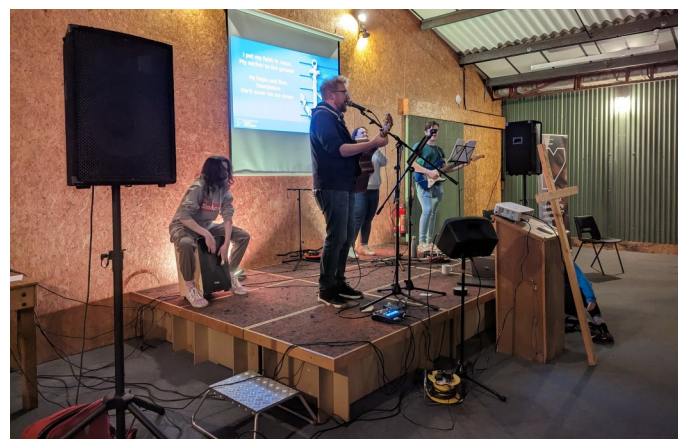
Worship in the barn at last year's Break Away.