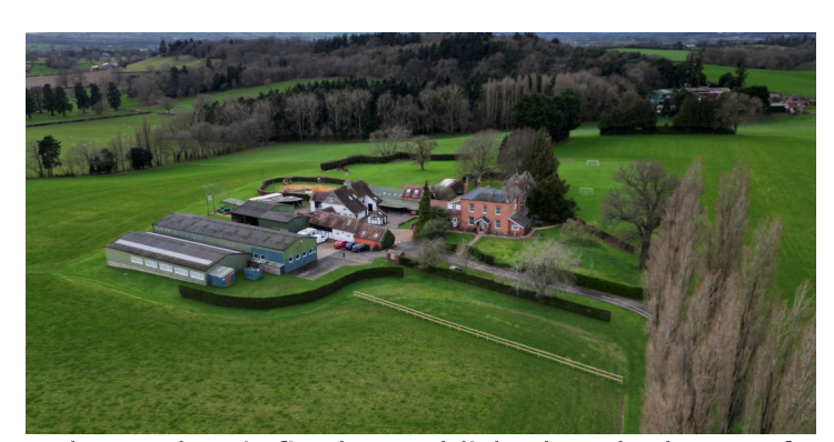
The Poplars is firmly established as the home of Break Away.

When the supermarket delivery turns up at a residential with our food delivery, they must wonder what is happening. To start with, our shop takes up most of the van. Endless amounts of bread, milk, vegetables, desserts, cereal and cheese, to name just a few things that are offloaded and packed away in the kitchen. Before long, 75 ravenous young people and 20 youth leaders descend upon the Poplars in Ledbury. In total, 110 people consume nearly 700 meals along with piles of cake. The catering task is huge, but the effort is worth it to see 75 young people having their lives changed by Jesus.